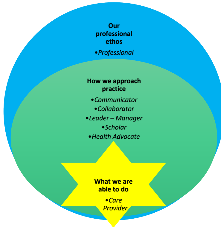
Figure 1. Conceptual framework for AFPC Educational Outcomes

The Association of the Faculties of Pharmacy in Canada (AFPC) sets the standards for pharmacy education. The goal is to graduate Professionals whose core role is to serve as Care Providers who use their medication therapy expertise to benefit patients, communities, and populations through the integration of Communicator, Collaborator, Leader-Manager, Scholar and Health Advocate roles. (See Figure 1.)